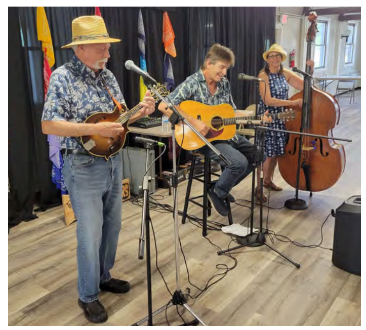
'Fret Mashers' brought the energy to our 'Bluegrass & Burgers' event with a great performance! (...and the root beer floats were pretty popular, too.)